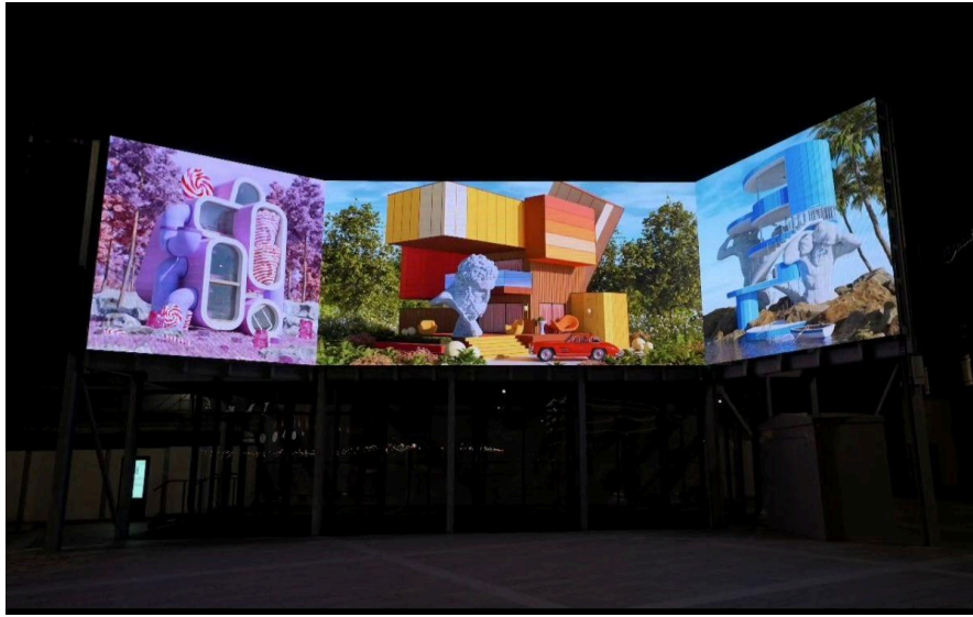
Sunderland, UK 2025

These digital screens feature customizable frames, allowing them to perfectly complement both the artwork itself and the home that will host it.