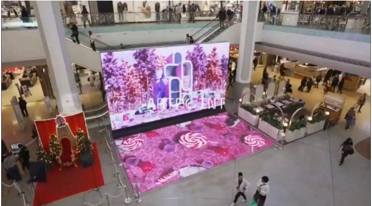
Nice, France, 2024

A work of art that combines the experience of a traditional painting with the expressive power of digital technology.